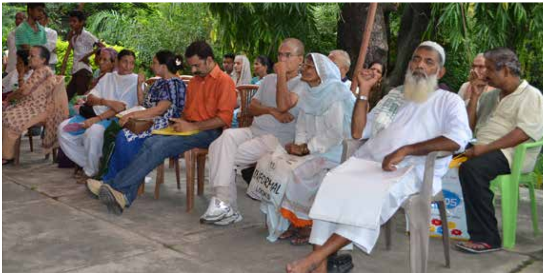
The Ganga Prem Hospice charitable cancer clinics are held on the last Sunday of every month in Rishikesh