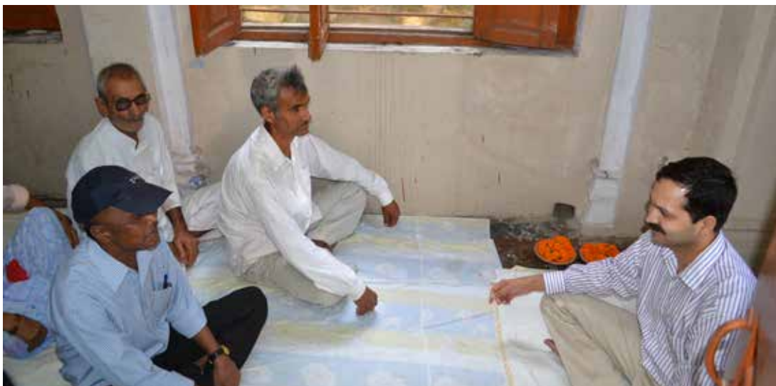
Guided meditation sessions at Ganga Prem Hospice clinics. Patients and carers alike benefitted from the sessions

symptoms that indicated the possibility of cancer and came to avail of the free cancer screening opportunity offered at the clinics.