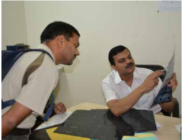
A Ganga Prem Hospice cancer clinic in progress in Dehradun

In addition to the monthly cancer clinics in Rishikesh, additional clinics are held periodically in other towns and cities of Uttarakhand, notably Haridwar and Dehradun. The medical team travels to these cities often on the day before the monthly Rishikesh clinic, or sometimes in the middle of the month. These cancer clinics are held in hospitals and other premises, donated by supporters of the Hospice project.