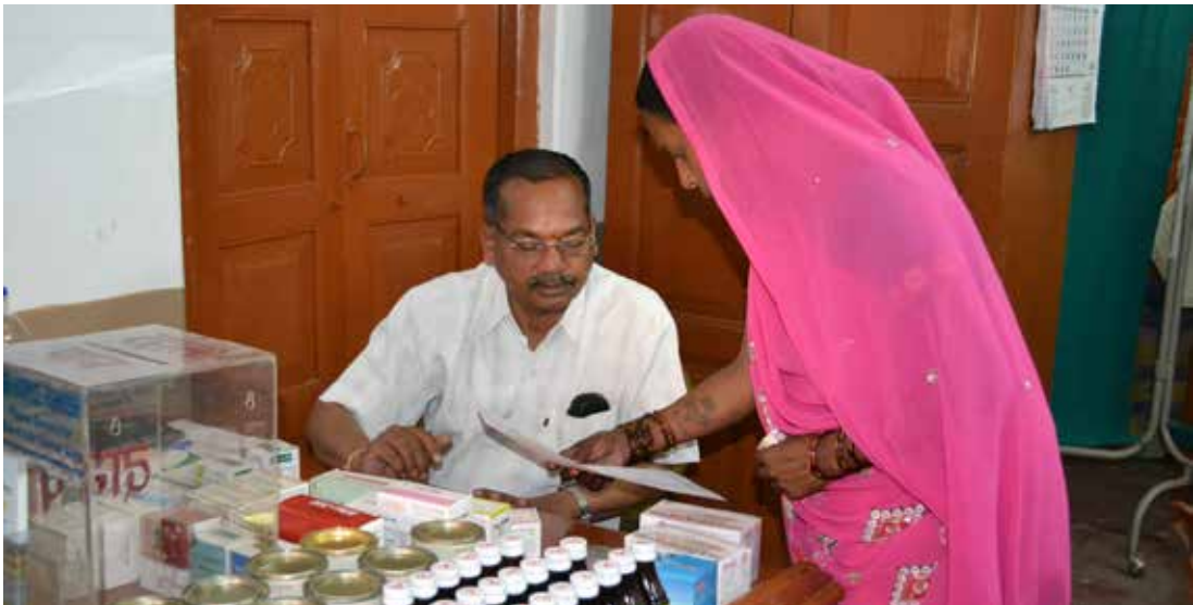
Patients are provided medicines, nutritional support, and various other kinds of help by Ganga Prem Hospice

The bereavement support service gives much needed support to family and friends after the patient has died. The support, in select cases, continues until the loved ones feel it is no longer needed.