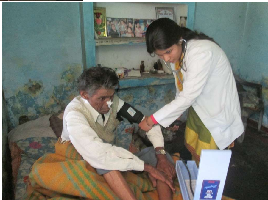
Most of the patients served by the Ganga Prem Hospice home care service were under-privileged.