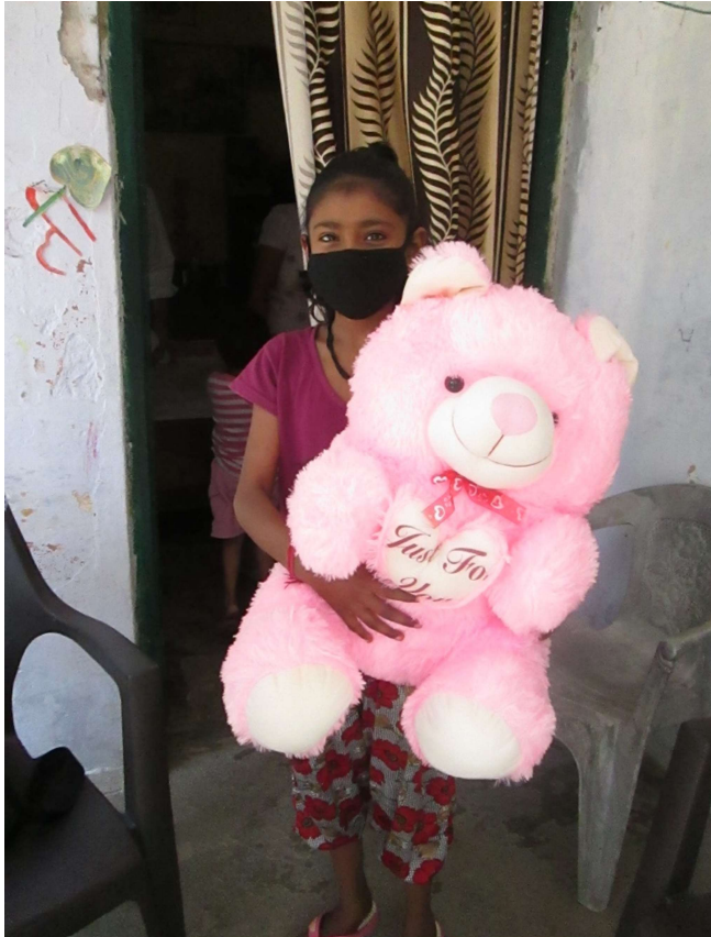
A child cancer patient of Ganga Prem Hospice is gifted a teddy bear by the Hospice team during a home care visit.

to receive support in their own homes. These patients were provided with nursing and emotional, spiritual help. This group of patients' families usually bought their own medicines and provided for any medical equipment that the patients needed, often donating any leftover medical accessories or medicine to GPH after the patient had passed away.