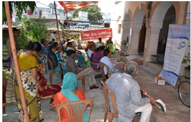
The Ganga Prem Hospice charitable cancer clinics are held on the last Sunday of every month in Rishikesh.

Most patients who come to the clinic are from lower-income brackets. Many people who come are already suffering from cancer and many more come with suspected cancer symptoms. New cases of cancer are generally diagnosed at clinics and the patients are directed to the correct procedures. Medicines are distributed free-of-charge at the clinic to under-privileged patients.